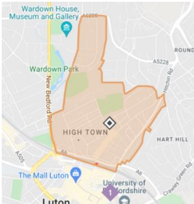
Above: the new part of the parish

I would like to thank everyone for your hard work, positive approach, devotion to the Lord, continued giving and creativity. Everyone is important to the Lord and together we make the church. I am proud of what we the people of St Mary's have achieved this year and the creativity, kindness and competence that we have shown.