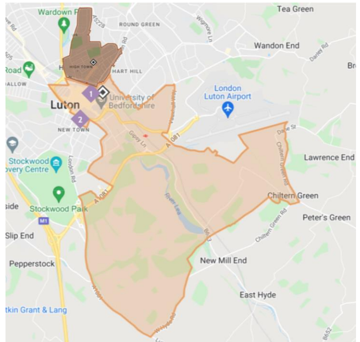
Above: the original parish with the new High Town addition (smaller scale)

This meant that we have more of the parish above the railway line and High Town Road has become part of the parish. You can see the parishes by searching on https://www.achurchnearyou.com